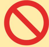
Prefer not say